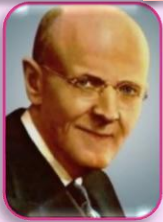
Rtn Paul Harris Founder of Rotary